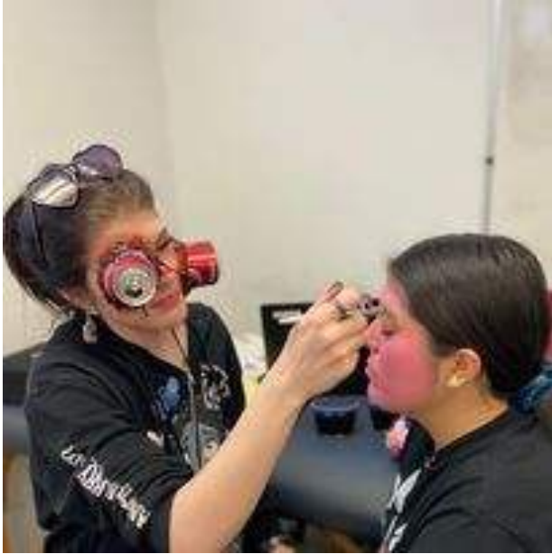
Estheticians practicing fantasy makeup.