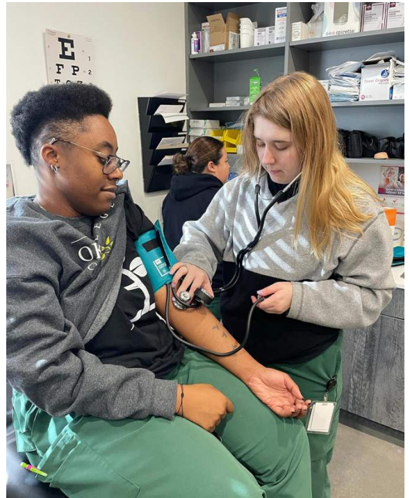
Medical Assistant Students taking blood pressure.